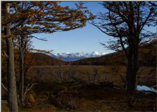
The Zarategui Bay with the Evergreen Forest ecosystem.

Tierra del Fuego National Park (Half day). A beautiful landscape where the Patagonian Fueguino Andean forest in contact with the sea of the Beagle Channel. The panoramic points of the different ecosystems, to capture photos and understand their inhabitants.